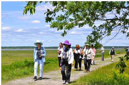
Plum Island 2014

Contact Kathleen Elcox at kelcox1@verizon.net