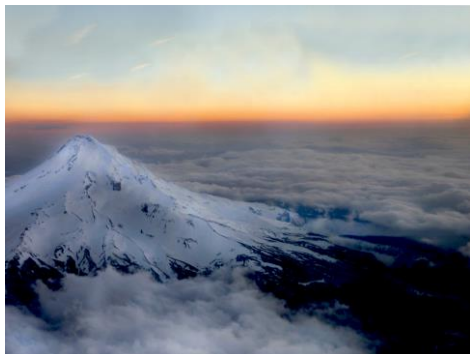
Mt Hood, Oregon 2012