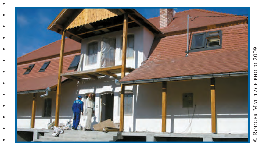
A work in progress: The Community House in Székelykeresztúr.

Through generous social action grants, special collections, individual donations and energetic youth service pilgrimages (including this most recent one) our First Parish community has been involved with the reconstruction project from the start. Built in the 19th century,