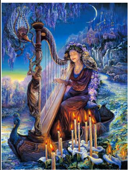
*Minerva is the Goddess of Wisdom and Poetry. We will share both at these gatherings.